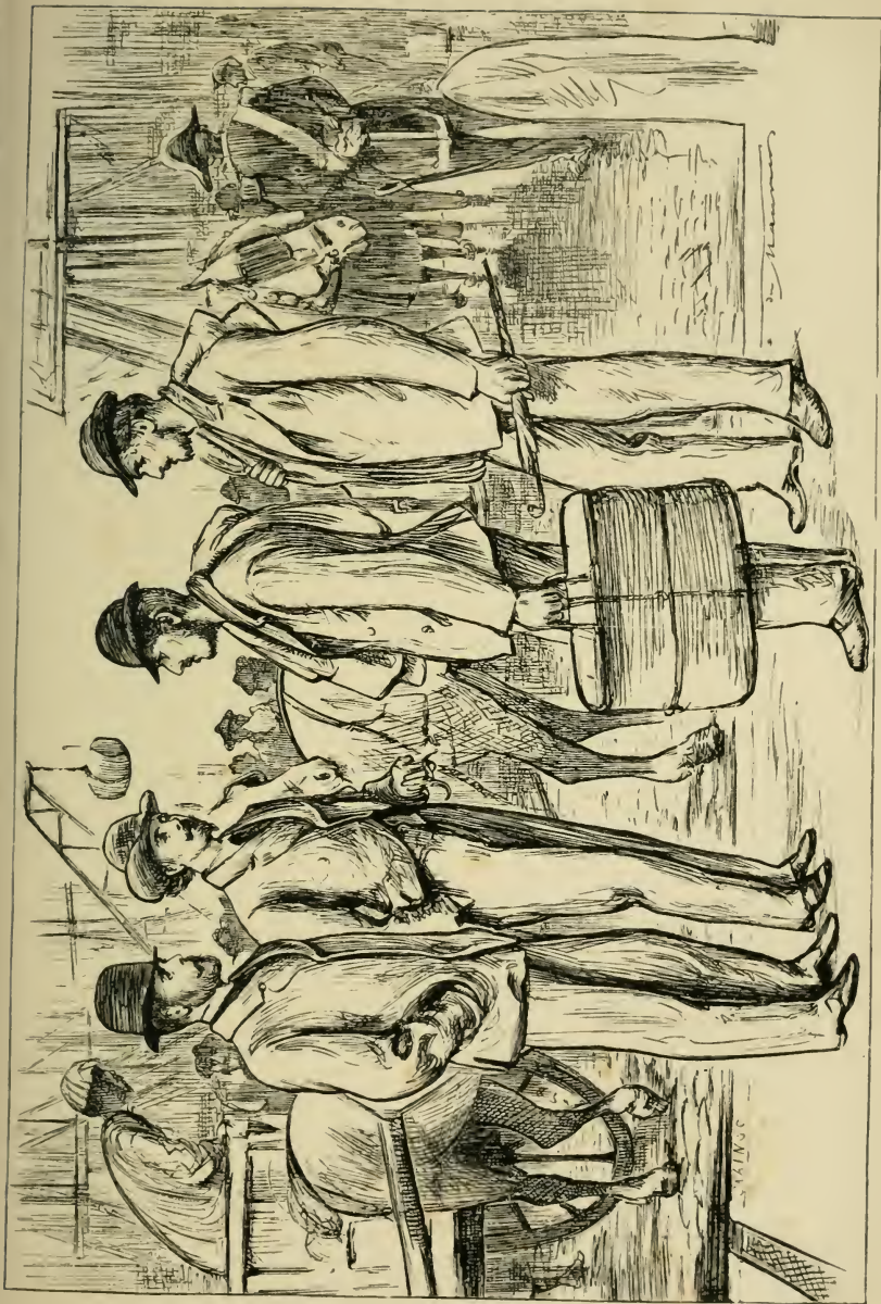
"CAN YOU TELL US THE WAY, SIR, TO THE HOTEL BOLD SOLDIER?"